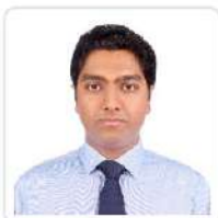
Photo (Head of Business Entity) :