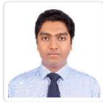
Photo (Head of Business Entity) :